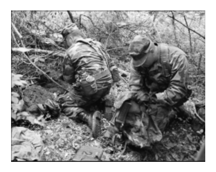
Setting up for the long haul. CDTF team members dig-in and setup their observation post.