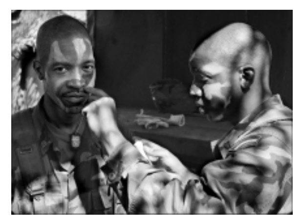
Soldiers from the 250th Signal Battalion camming up.

The 42nd DISCOM supported all maneuver training with medical, maintenance, supply, and transportation personnel, in addition to LANES training, a mass medical casualty exercise, and extensive night