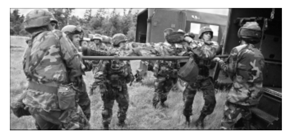
Medics from the 50th Main Support Battalion participate in evacuating casualties during the DISCOM's mass casualty exercise.

It was a challenging month for the New Jersey warriors. More than 500,000 miles were logged by units with close to 45,000 meals served. All troops made it home safely, with only minor incidents and injuries noted. AT-2000 will go down in the history books as one of the most successful deployments in recent years. *