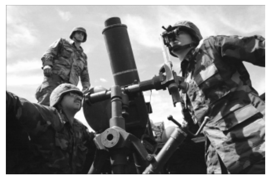
Soldiers from the 1-114th Infantry, 2-113th Infantry, 2-102nd Armor, and 5-117th Cavalry participated in the combined mortar school.

The 50th Brigade/DISCOM task force had to contend with cold, wet weather, alternating with hot dry, dusty conditions during their rotation. They echoed the old saying that "if you don't like the weather, wait five minutes and it will change." Training highlights for the 50th Brigade included tank gunnery by the 2-102nd Armor on the newly com-