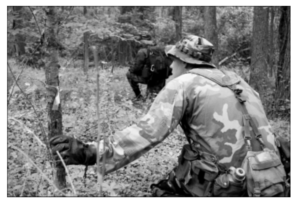
Freeze.\ CDTF \ team \ members \ hold \ their \ positions \ before \ advancing \ on \ a \ suspected \ drug \ position.