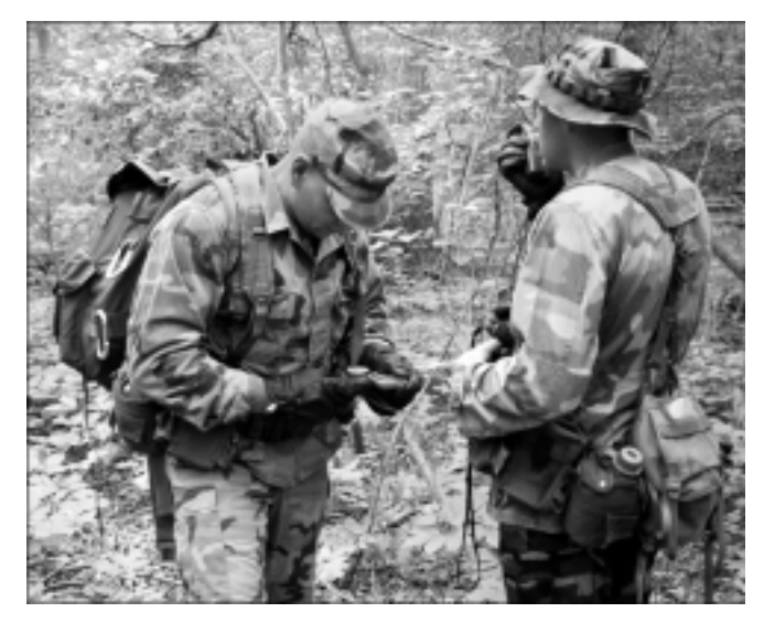
CDTF personnel radio in their location prior to digging in for a surveillance operation.

Recent changes in the New Jersey statutes have highlighted the importance of the eradication team. In August 1997, possession of 50 marijuana plants outdoors and/or 10 marijuana plants indoors was a firstdegree felony.